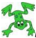
Fred the Frog

Children are taught to 'Fred' talk words by sounding out and blending to read. m_a_t